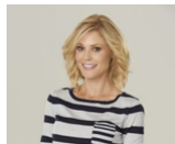
Claire Pritchett Jay's oldest child Born: 1972