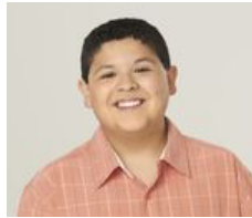
Manny Delgado Jay's stepson