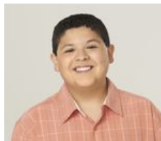
Manny Delgado Jay's stepson